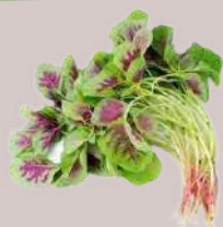
Chinese Amaranth 莧菜