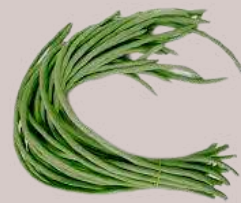
String Bean 豆角