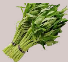
Water spinach 通菜