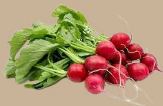
Cherry Radish 櫻桃蘿蔔